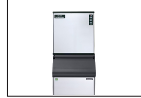
T304 Stainless Steel Panels