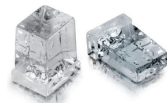
Full Cube - 12g (26.5 x 26.5 x 26 mm)