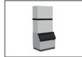
Double Stack (Needs a stacking kit sold separately)