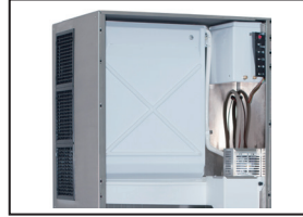
Vertical Cube System