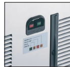
Front ON-OFF Switch