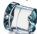
Ø 29 x H 34 mm